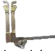
Self-retaining cervical retractor frame