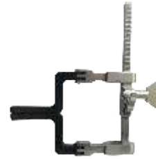
McCULLOCH retractor frame for microdiscectomy - BA02910000